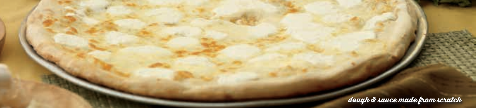
dough & sauce made from scratch