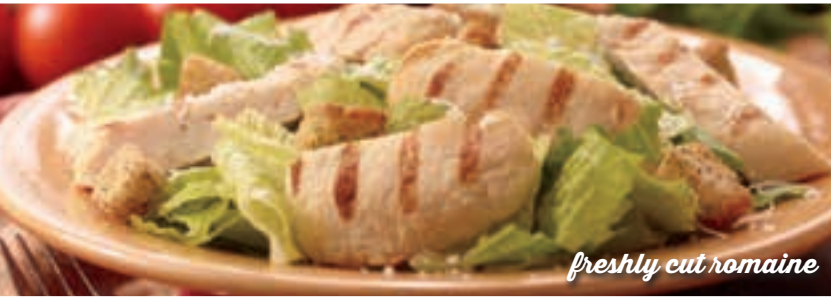
freshly cut romaine

DRESSINGS: Bleu Cheese, Balsamic Vinaigrette, Ranch, Honey Mustard, Greek, Golden Italian, Caesar