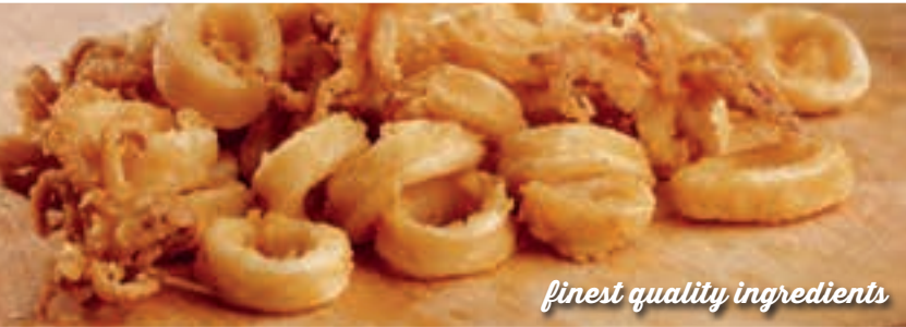
finest quality ingredients