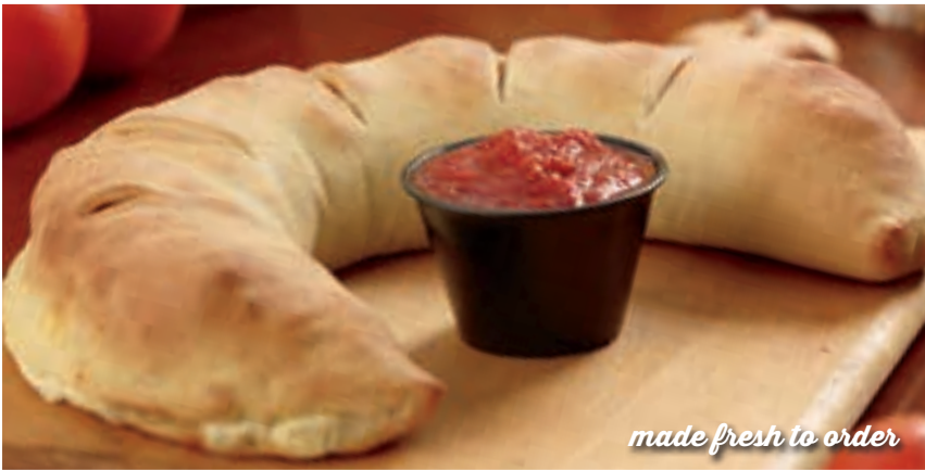
made fresh to order